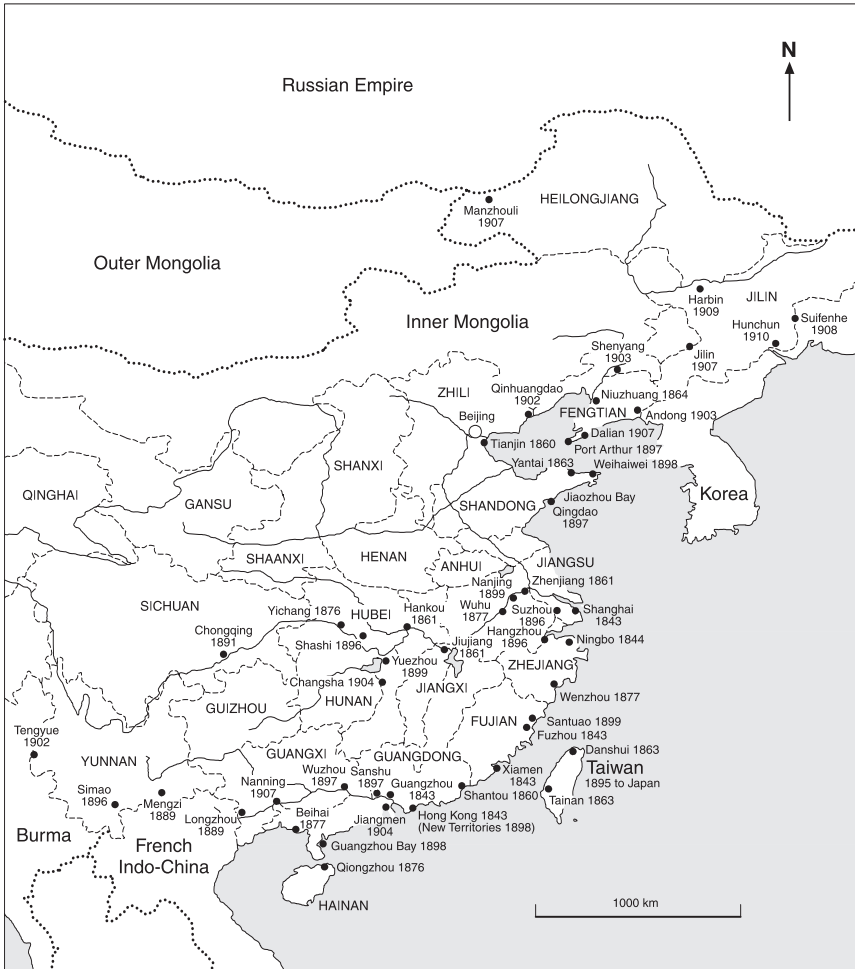
Map 1 China's treaty ports

The post-Opium War treaties of the 1840s first opened five ports to foreign merchants and diplomats. Over the following decades, more coastal and riverine cities were opened. In some of these cities, “concessions” were established where foreigners were essentially self-governing beyond the laws of the Qing and the later Republic of China. As well, less formal but much broader “spheres of influence” were guaranteed by the right to send warships and armies into the interior. The most important spheres of influence were those of Britain in Hong Kong and Guangzhou (Canton), and especially Shanghai, Hankou, and the Yangzi Valley; France in Guangzhou Bay and Fujian; Russia and Japan in the northeast; and Germany and Japan in Shandong.