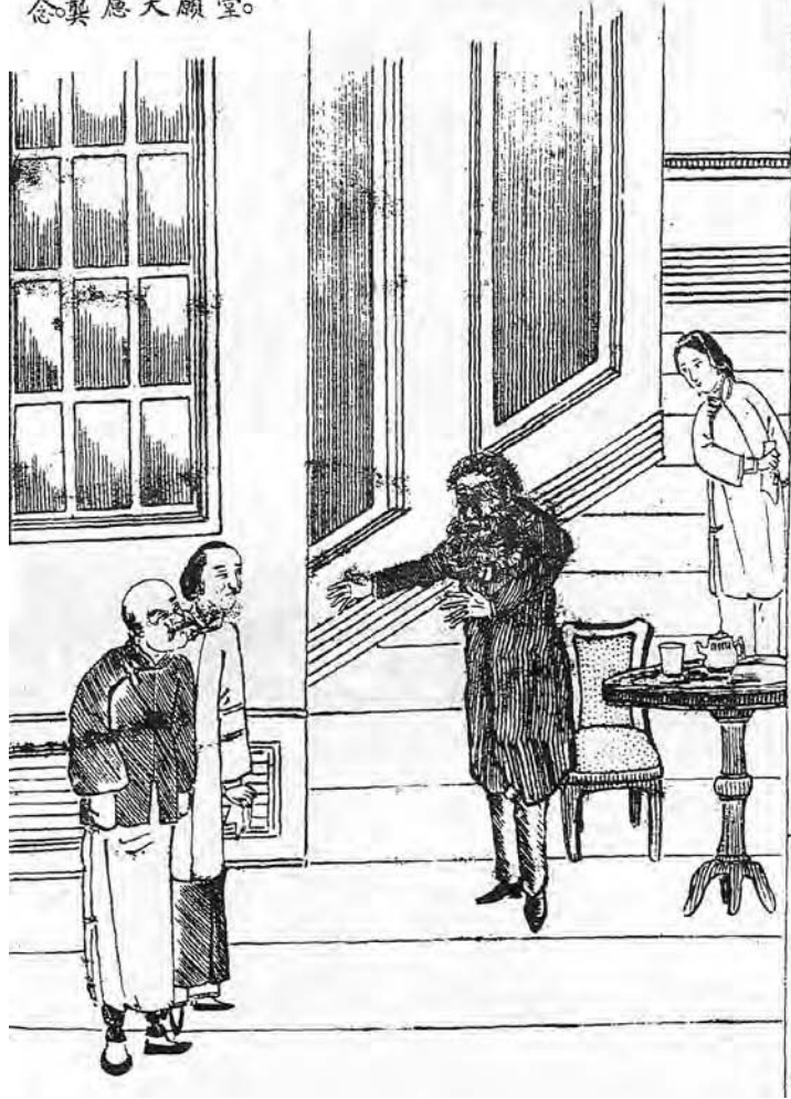
Figure 3.2 “Free Marriage” – a girl who doesn’t want to marry the man of her parents’ choice has brought in a (rather hairy) foreign missionary to plead her case and convince her parents to allow her to study at the missionary school for girls.

本邑周浦教民蔡某將及笄之女許字年已四十餘之同教丁姓女堅執不願與丑力爭數次蔡夫婦置不理前日丁登門謁岳俗所謂通脚婿者蔡擬喚女與婿親面女即奔至唐橋教堂訴之神父並自陳不願之意神父遣人召蔡夫婦至堂責令退婚且慮回家後仍有變通留蔡女在堂讀書以絕其念