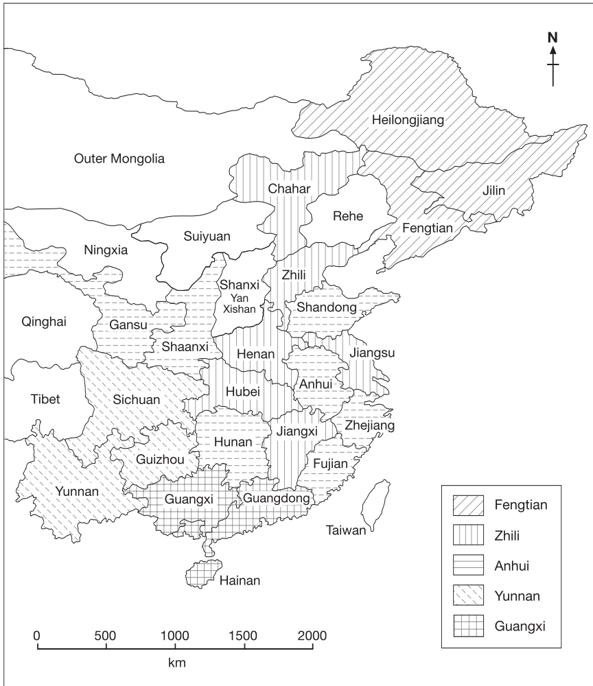
Map 4 Warlord China, 1920

After Yuan Shikai's death in 1916, China collapsed into militarism. By 1920, loose congeries of "warlords" controlled particular regions as follows: the bandit-turned-general Zhang Zuolin was based in Manchuria, forming the "Fengtian clique." Yuan's former subordinate Feng Guozhang controlled the "Zhili clique" until his death in 1919, after which Cao Kun and Wu Peifu took over. Another former Yuan subordinate, Duan Qirui, controlled the "Anhui clique", which was defeated by Zhili in 1920. The southeast (Fujian, Guangdong, Guangxi) and especially the southwest (Sichuan, Guizhou, Yunnan) were divided among competing smaller warlords.