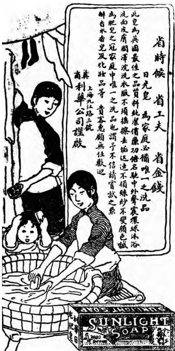
Figure 11.1 Women of the new urban middle classes were expected to be “good wives and wise mothers” – understanding hygiene – and good consumers who knew how, in the words of this soap advertisement, to “SAVE TIME, SAVE LABOR, SAVE MONEY.”