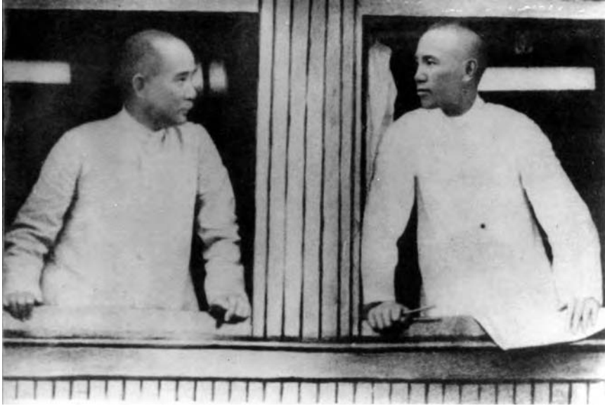
Figure 12.1 Sun Yat-sen (left) and Chiang Kai-shek (right), aboard a train.