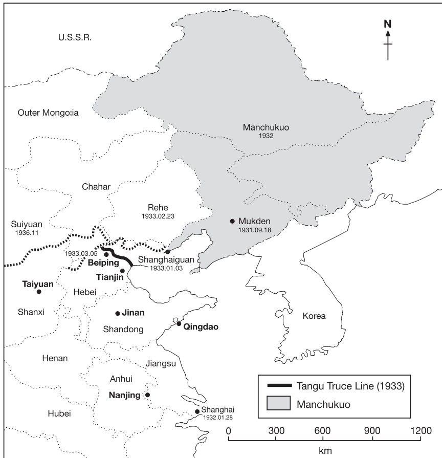
Map 7 Japanese incursions, 1931–6

weakened the legitimacy of the Nanjing regime. Furthermore, if the Japanese were but a superficial disease, the loss of Manchuria none the less cost the Nationalist government 15 percent of its tariff revenues. Stronger resistance to Japanese aggression might have made Japan's victories more expensive. The Tokyo government might then have been able to restrain the Kantō Army, though some kind of blow-up over Manchuria was probably inevitable.