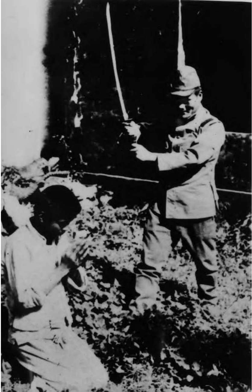
Figure 15.1 During the Japanese invasion, numerous atrocities were documented. Sometimes Japanese soldiers had Chinese prisoners dig their own graves (holes in the ground) before killing them, as in this photograph that Guomintang sources attribute to the Nanjing massacre of 1937.