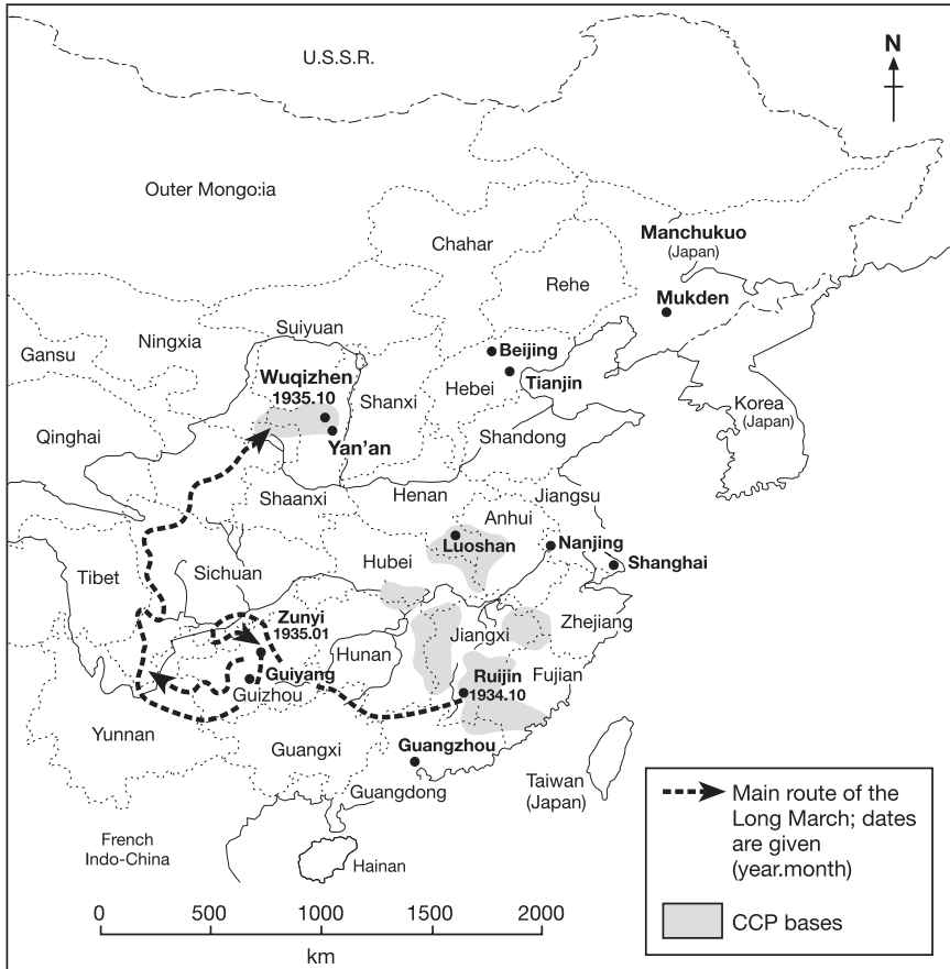
Map 8 The Long March (and CCP base areas)

For Mao, the Long March was virtually over. After 10,000 winding kilometers, mostly west and then north into arid hill country, the survivors – about 8,000 plus a few more who had joined the Communists en route – reached