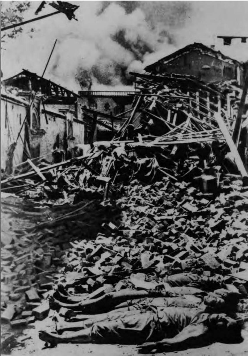
Figure 15.2 Later in the war, Japanese bombed a Guangzhou neighborhood.