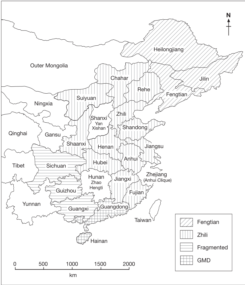
Map 5 Warlord China, 1924

By 1924, the Zhili clique under Wu Peifu dominated most of central and northern China. Betrayed by his subordinate Feng Yuxiang, however, Wu was then defeated by Zhang Zuolin's Fengtian forces, which took over Beijing and much of northern China at year's end. Southwestern China remained fragmented, but the Guomindang under Sun Yat-sen was building support in Guangdong. The well-protected province of Shanxi remained politically stable throughout the period under the cautious reformism of Yan Xishan. Both Yan and Feng Yuxiang became supporters of the Guomindang in the late 1920s, though Yan was able to maintain his independence.