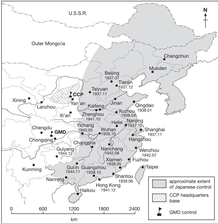
Map 9 The Japanese invasion, 1937–45 (Japanese/GMD/CCP territory)

This was the “three alls” policy: kill all, burn all, destroy all. In northern China entire villages were razed, crops seized or destroyed, and peasants slaughtered. The strategy succeeded in reducing an underground Communist structure to roving guerrillas and reduced the size of the Communist base areas, but it obviously was no way to make China an economically productive part of the Japanese Empire. Even if Japan could afford the loss of soldiers in battle, the financial costs were another question. The bill for the China war soon came to $5 million per day . 10 Japan, a