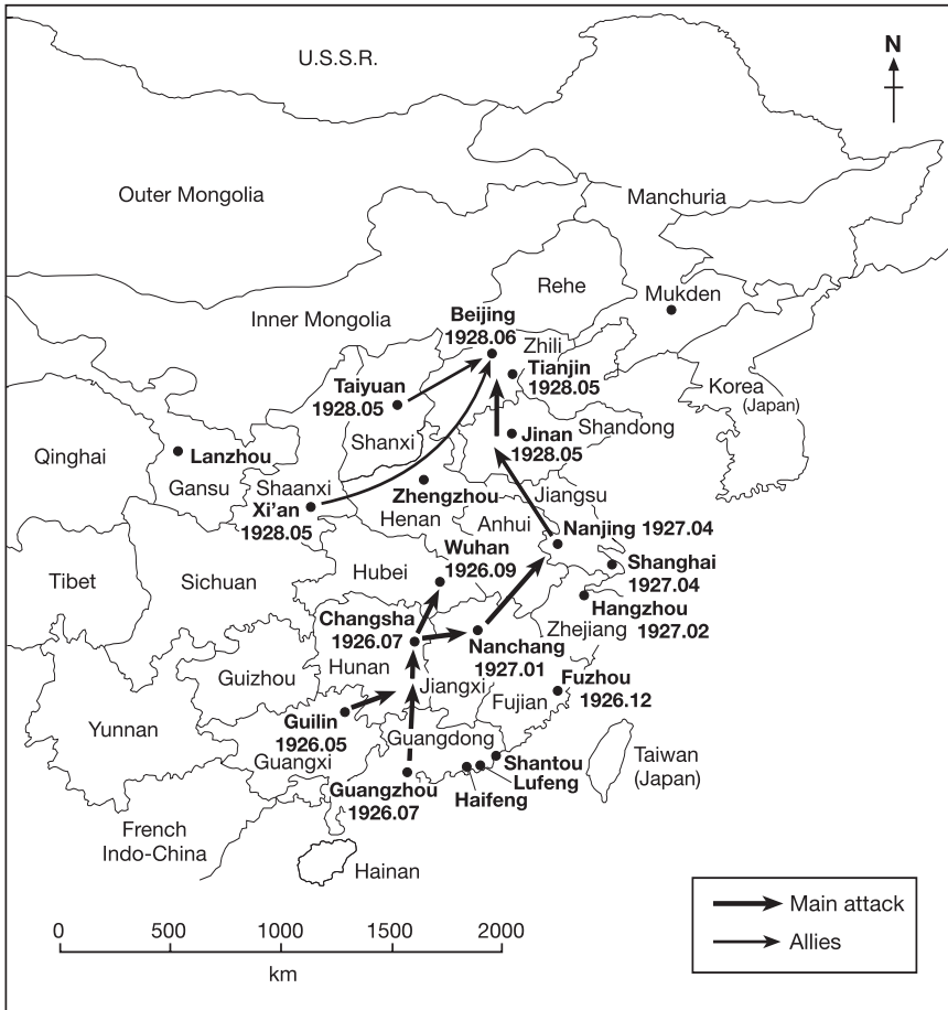
Map 6 The Northern Expedition

The Nationalists' victories had sparked even wider social mobilization in China's central and southern provinces. Unlike the 1911 Revolution, women did very little actual fighting in the Northern Expedition, but hundreds served as nurses, propagandists, spies, and porters. Perhaps a majority of these were Hakka women, since they had natural (unbound) feet. One won fame for dragging a wounded soldier off the battlefield while dodging