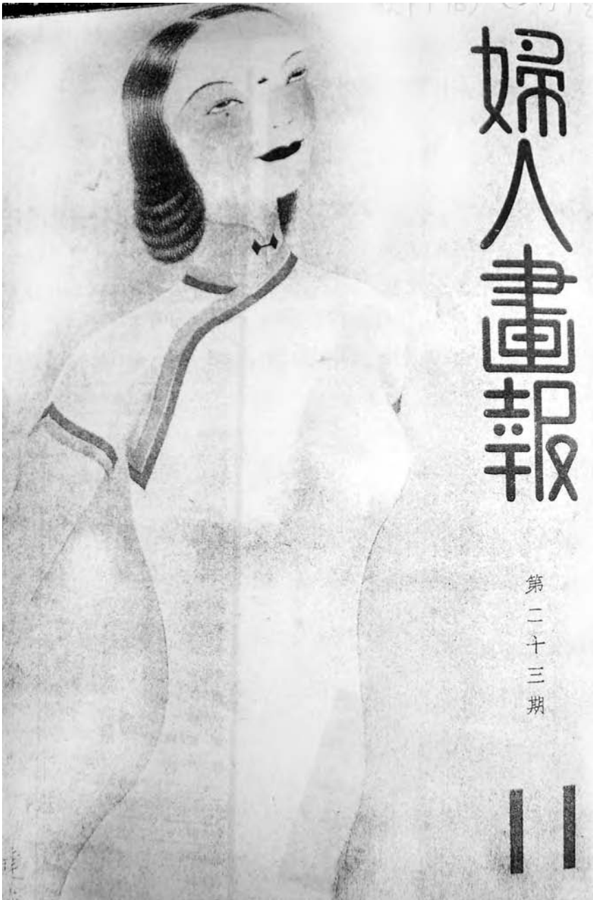
Figure 11.2 Women continued to achieve a new public presence through the 1920s, at least in the cities. Wearing an elegant qipao , this beauty adorned the “Women’s Pictorial.”