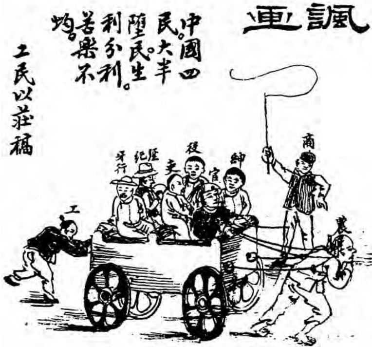
Figure 3.1 A cartoon of workers and peasants carrying the burden of China's progress: a peasant pulling and a worker pushing a cart full of happy-looking gentry, officials, traders, and brokers. Merchants have the whip hand. In other words, China's better classes depended on exploitation.

Hu Hanmin thus insists not on China's unique qualities but rather on China's readiness to join the trends of modern history. Revolutionaries such as Hu understood democracy as the only alternative to the monarchy they wished to destroy. Their critics accused the revolutionaries of a failure to thoroughly consider how democratic institutions could be rooted in China's monarchical soil. But it is not clear how useful detailed musings about