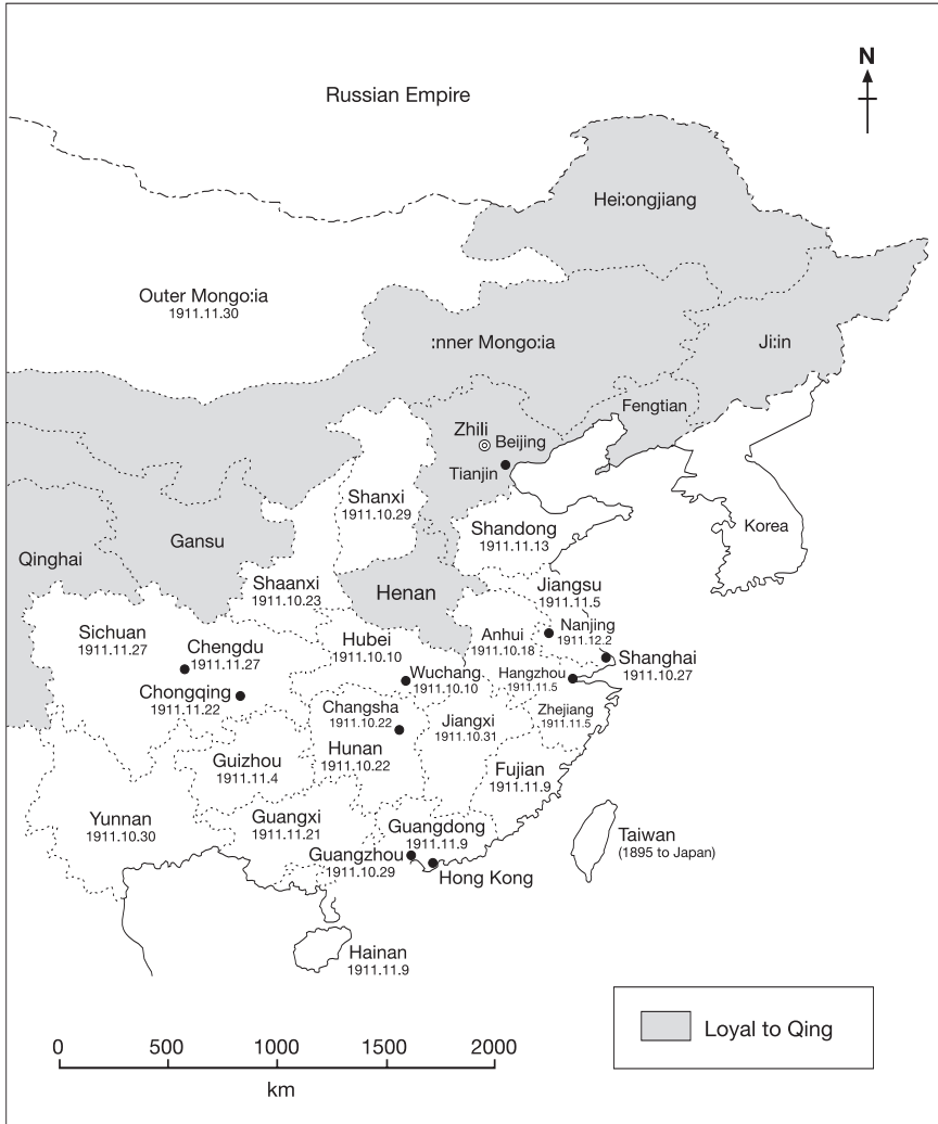
Map 2 Provincial secession during the 1911 Revolution

The 1911 Revolution took the form of separate secession movements from the Qing Empire from October 1911 to February 1912 (dates are given “year.month.day”). Often, a combination of youthful revolutionaries, local military men, and leading gentry took control of the provincial capital or some other city and declared the province independent from the Qing. Their powers often did not extend much beyond the city limits, and their goal was not independence (except for Mongolia) but a new kind of national government. The Qing never recovered from the psychological shock of widespread revolutionary action.