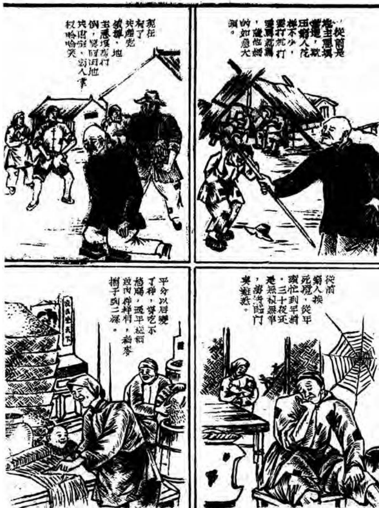
Figure 17.2 Communist propaganda comparing “before” and “after.” The before picture on the upper right shows a landlord who looks remarkably like Chiang Kai-shek lording it over peasants. But the after picture on the left shows the landlord overthrown “under the leadership of the Communist Party” and the peasants rejoicing. Similarly, the before picture on the lower right shows a family in deep poverty. But the after picture on the left shows that the distribution of goods gives everyone enough food to eat and clothes to wear; this picture also suggests a traditional peasant utopian ideal of household production – men farming and women weaving – that in fact the CCP did not intend to institute.