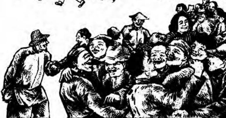
Figure 17.1 Communist propaganda. Mao Zedong (top right) is praised for two policies. First (top left and middle), satisfying the needs of the poor peasants and laborers. Easily-remembered doggerel speaks of the successes of land reform. Second (right and bottom), uniting with the middle peasants. Again, easily-remembered rhymes claim a unified poor and middle peasantry overthrows the landlords.

(二) 團結中農 依貧中農是一 家，不分什麼 你我他，我條 個個團結起， 地主惡霸都打 垮。